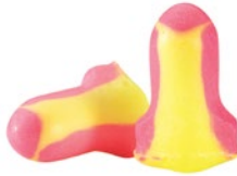
Laser Lite® Highly visible protection

NRR 33 MAX1-USA MAX30-USA CAN A(L) uncorded corded