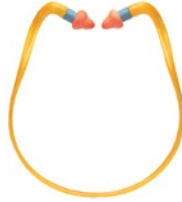
QB2® HYG Supra-aural protection