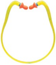
QB1® HYG Inner-aural protection

An alternative for those who work in intermittent noise or for managers and visitors who move in and out of noisy areas.